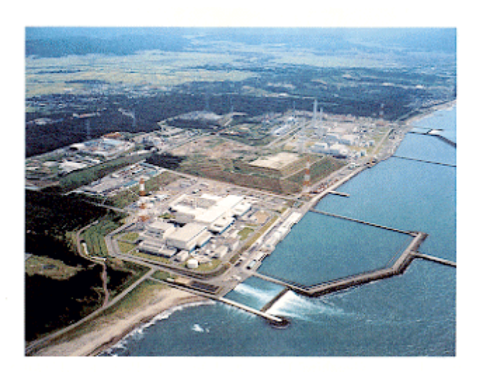
The Kashiwazaki-Kariwa plant

That would have been a catastrophic event where the damaging effects of the quake itself and radiation leaked from the plant reinforced each other.